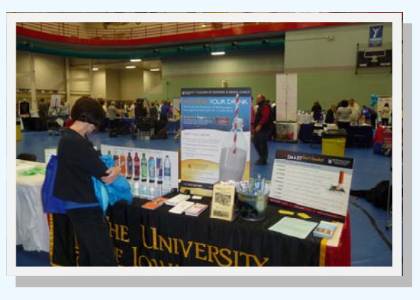
(Above): A front view of the College of Dentistry's booth.