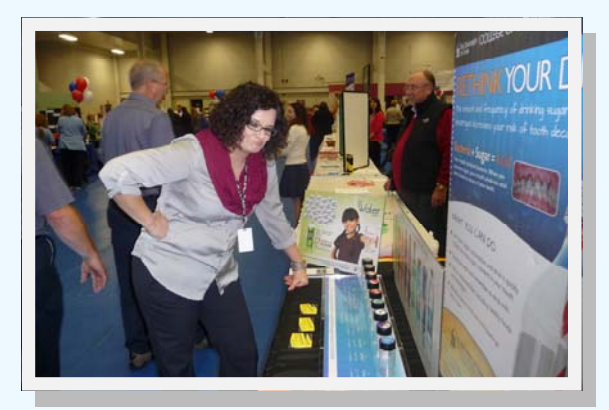
(Above): A visitor from Johnson County Public Health peruses the College of Dentistry's booth display during the recent UI Health Fair, which was held at the UI Field House on November 5.