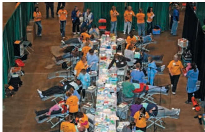
The U.S. Cellular Center in Cedar Rapids hosted the 2010 Iowa Mission of Mercy.